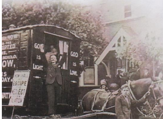
Mill Grove, Crescent Road, South Woodford, E18 1JB

There will be time to explore the allotments, wood, and village. During the afternoon the woodland will be dedicated.